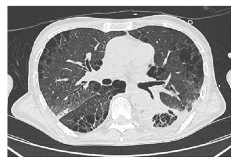
Fig. 1 Pattern of interstitial pneumonia on chest CT scan

We practice continuous oxygenation and ventilation during all the procedure with HFNC with the following settings: flow 60 L/min, Fio2 100%, and temperature 37 °C. Intravenous midazolam 0.05 mg/kg and sedation were started with a bolus of propofol 0.5 mg/kg and maintained in continuous infusion at 3.5 mg/kg/h. The duration of the procedure was approximately 25 min. The parameters were stable for the whole duration of the intervention with SpO2 always > 95% in spontaneous breath and MAP>70 mmHg. After the procedure, the patient returned to the intensive care unit to complete the set antibiotic therapy. Three days after the operation, the patient finishes the 10 days of antibiotic therapy with azithromycin. During the following 10 days, we reduced respiratory support while always maintaining a P/F ratio > 250. Initially, we alternated HFNC with high FiO2 (>40%) with MdV. From the fourth postoperative day, the patient alternated cycles of spontaneous breathing in ambient air during the day with nasal cannulas (FiO2